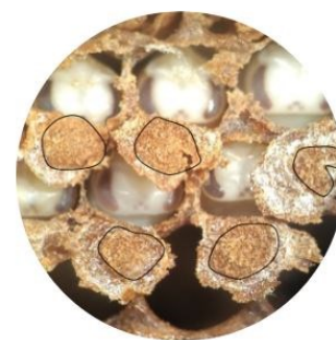
Black lines indicate recapping area.

Good luck to those members who are actively looking for effective alternatives to chemical treatments and risking their own bees in the trials.